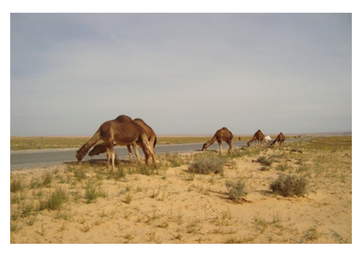
Figure 2: Typical range for extensive dromedary rearing in Tunisia