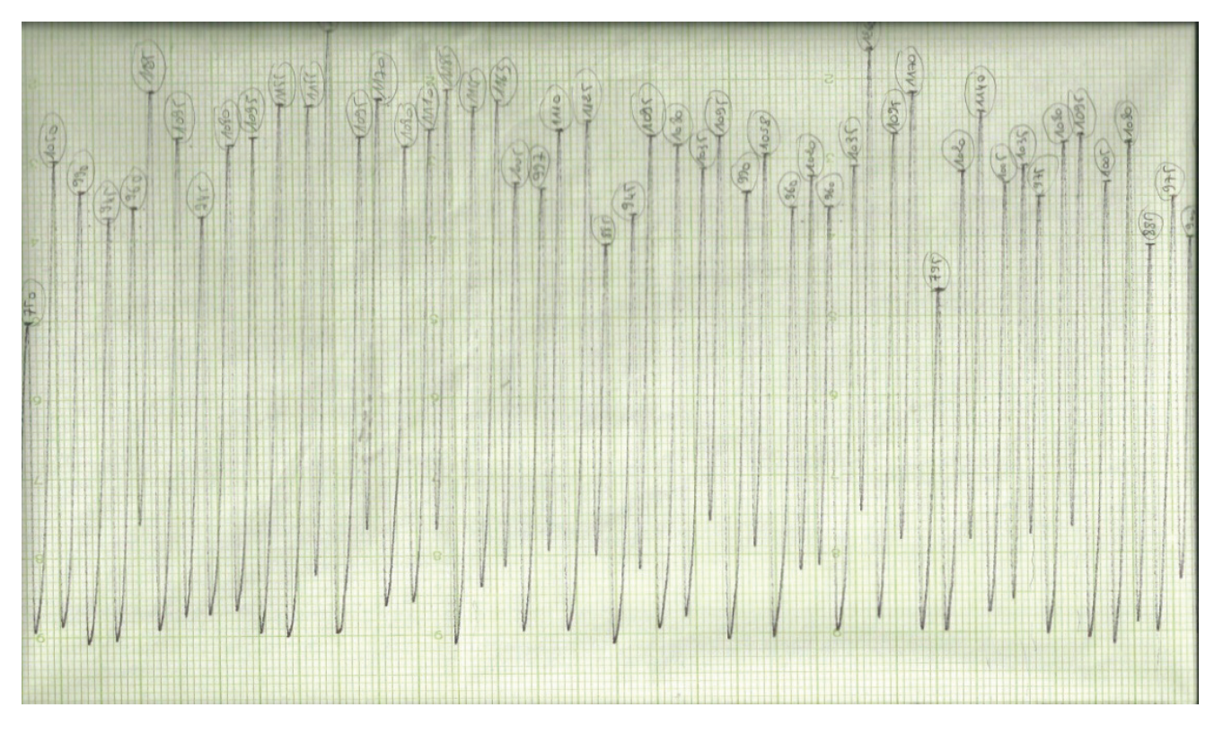
Figure 4: Methane emission in dairy cattle and its variations with time (5mm/min)

According to Jouany (2000), camel has high buffering capacity for acid feeds with a ruminal pH never below 6 and does not show metabolic disorder such as acidosis which is frequently observed in dairy cattle fed high concentrate diets. Ruissi (1994) measured volatile fatty acid profile in the rumen of the two species and reported that the ratio of propionate over acetate was higher in camel compared to cattle receiving the same feeding ration. The limited production of acetate in the camel may explain to some extent the reduced production of methane.