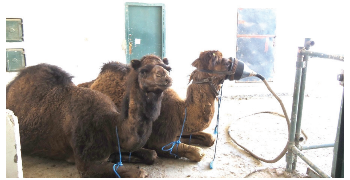
Figure 2: A camel carrying a facial mask for measurement of methane emission with a companion to reduce the stress on the experimental animal